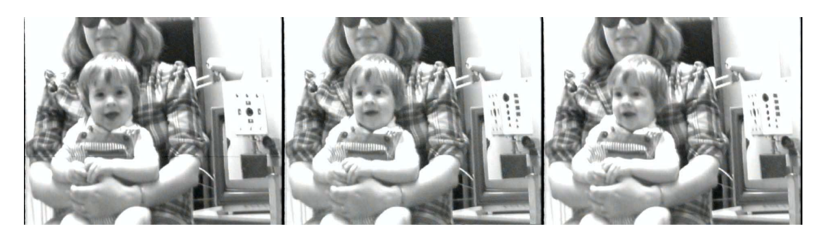
Figure 1: Example of following the "gaze, of a robot; Movellan & Watson (1987). The reflection of the robot can be seen in the mirror at the right of each image. Note also the child's positive affect.

Our hypotheses about abnormal parameter settings of the learning mechanisms also fall in line with previous theories about autism. For instance, Gegerly and Watson