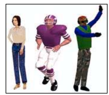
Figure 3: Some of the computer animated characters.

Virtual caregivers are programmed to manipulate objects (e.g., toys) in the virtual world while looking at them, and to periodically look at the infant. The exact behavioral program of the caregiver is modeled after the statistics of human infant-caregiver interactions derived from the observational study. The virtual infant is likewise programmed with realistic preferences and capabilities described above.