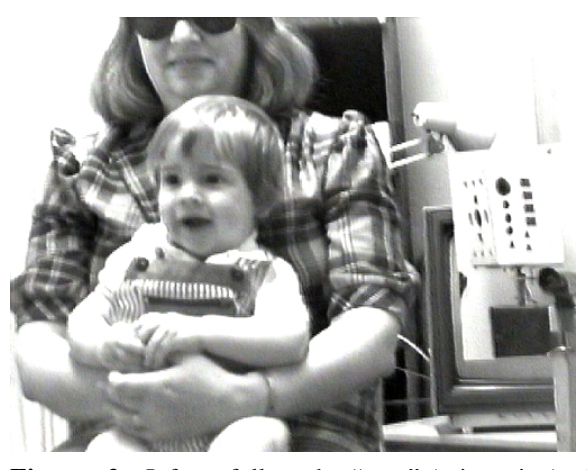
Figure 2. Infants follow the "gaze" (orientation) of a non-humanoid robot that moves contingently. Infants also show positive affect toward the contingent robot.

more rapidly across trials when targets were repetitive and simple than when targets were distinctive and complex. Apparently infants learn over several trials whether an adult is producing valid social cues—that is, whether the parent is looking or pointing at interesting or boring things.